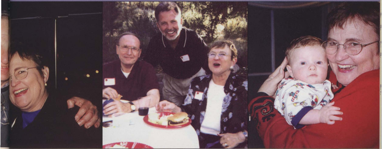
ng of Justice Shearing